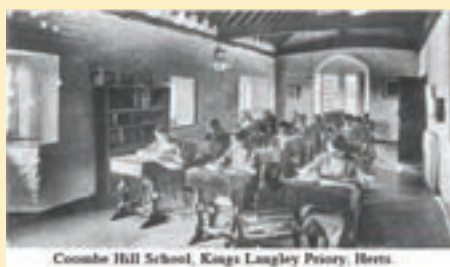
Coombe Hill School, Kings Langley Priory, Herts.

Did you know that there are the remains of a 14th century Dominican priory at the top of Langley Hill? Help uncover the village's hidden history: become a Friend of The Priory to help