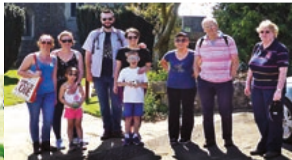
Walkers of all ages enjoyed the sunshine during Beating the Bounds

Beating the Bounds is the ancient annual practice of walking around the boundary of one's Parish, as a way of identifying where one lives, and by extension asking questions about one's existence. The practice takes place on Rogation Sunday, the fifth Sunday after Easter.