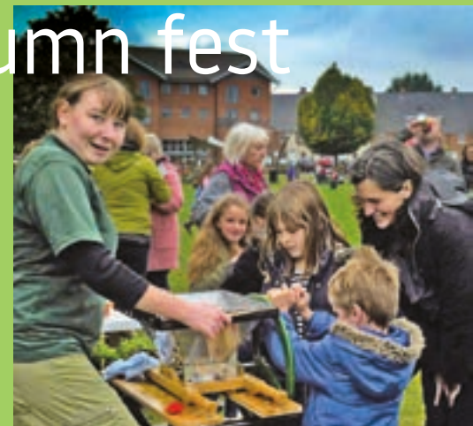
Children enjoy apple pressing with Sunnyside Rural Trust

It's a fun filled, low-tech event for all of the family promoting the availability of locally produced foods, with produce and plants to buy on the day. There's live music and entertainment with lots for kids to get involved in, and refreshments available. Bring the family and enjoy the day! More info on Facebook: Abbots Langley AutumnFest