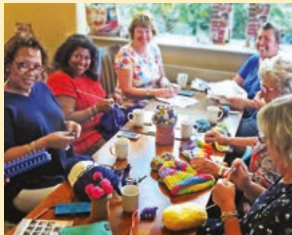
Cheerfully creative, ladies at work during their regular Wednesday morning KLAC session