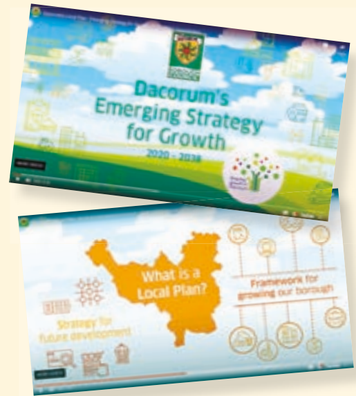
Above: Screenshots from Dacorum's website which explains the Local Plan in detail

to participate in the consultation which can be done online at www.dacorum.gov.uk/localplan .