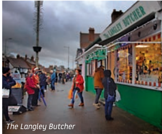
The Langley Butcher

The winner of the Parish Council organised Best Christmas Themed Premises in the High Street is Langley Butcher who will donate their £50 prize money to the Hospice of St Francis.