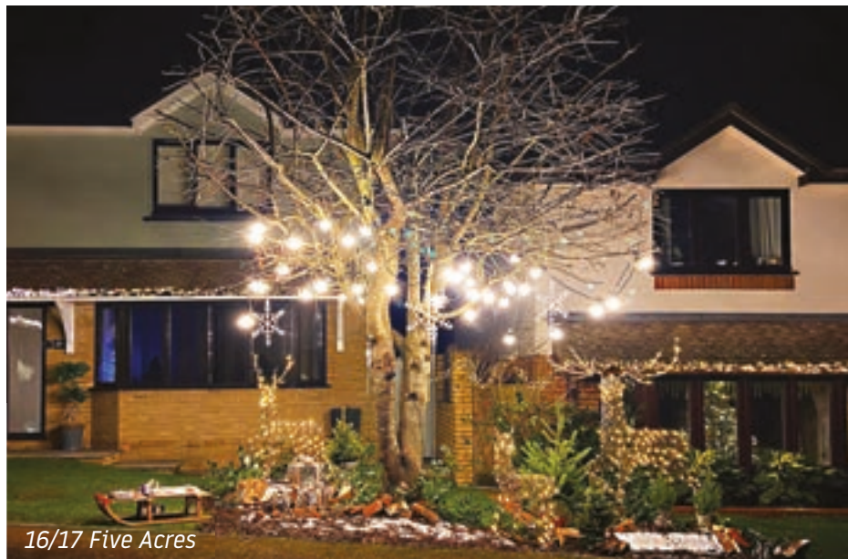
16/17 Five Acres