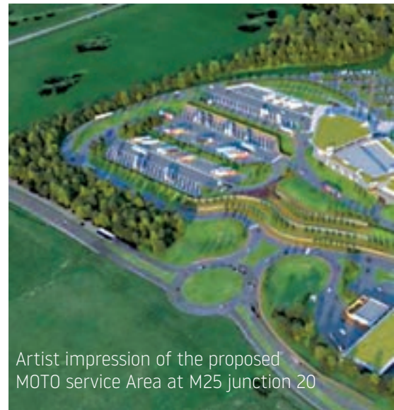
Artist impression of the proposed MOTO service Area at M25 junction 20

KL&DRA are urging local people to object again, setting out how the harm caused by the service area will far outweigh any benefits. 'We know that others are being promoted by Extra