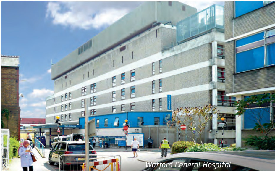
Watford General Hospital