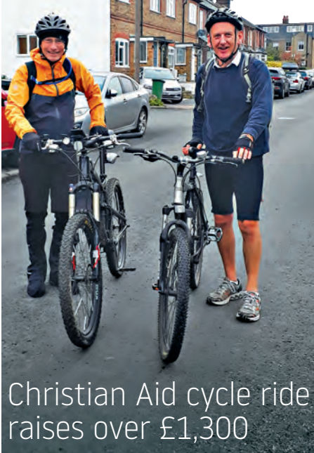
Christian Aid cycle ride raises over £1,300