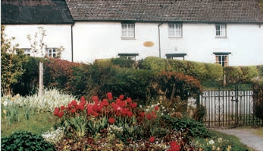
Left: Brecon Forest Farmhouse

As well as the opportunity to meet old school friends, there will be a licensed bar, a Hog Roast and other refreshment outlets. There will be organised activities on the field for children, a Grand Draw with some fantastic prizes, and displays of memorabilia from the fifty years in Wales. Sixth formers will run tours of the new school building – which many have yet to see.