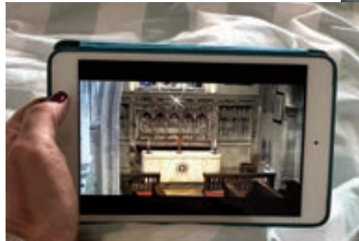
Available live and for 'catch-up', services from All Saints

Now we are planning to bring our Sunday morning services into the homes of those who can't get to church. It is a free service funded by The Joseph Rank Trust, who aim to enable church services to be enjoyed by those who are less able to participate in regular worship, particularly in care homes, and it is already in operation in several other churches. Our service will be broadcast live and available online or via a smart TV – plans are well-advanced and ready to go 'live' imminently.