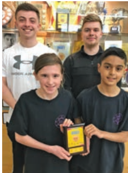
Proudly showing off their School Games Mark gold award plaque!

Kings Langley Primary School has been awarded the Gold Level for School Games. This is an outstanding achievement, recognising time and effort that is put into encouraging children to participate in sport related activities inside and outside of school.